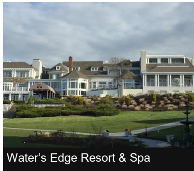
Water's Edge Resort & Spa

Thank you to everyone who attended our 2nd Annual New England Perfusion Symposium on Saturday, April 30, 2016 at Water's Edge Resort and Spa. We had a phenomenal perfusionist turnout and tremendous support from our sponsors. Without their generous donations, we would not have been able to provide you with a meeting constructed of such high-quality and superior content. Topics ranged from hypobaric oxygenation, primary graft failure, robotic MV surgery and cerebral oximetry, to myocardial protection and hemodilution. It was wonderful to see the interaction and open discussions amongst the various clinical disciplinary groups.