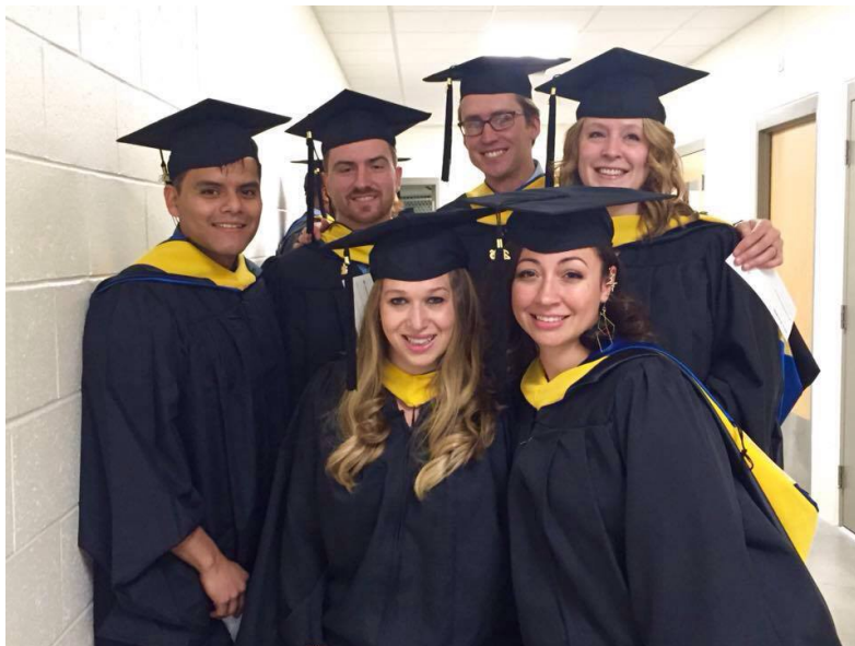
2016 Quinnipiac University MHS/Cardiovascular Perfusion Commencement Ceremony

Professional Activity Report Due for CYCLE 2: August 1, 2016